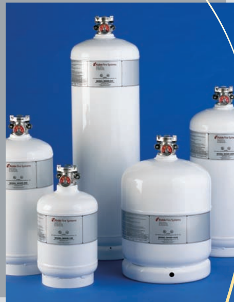
Kidde WHDR System

Investing in a Kidde WHDR System guarantees more than compliance with UL Standard 300, NFPA 96, NFPA 17A and insurance codes—it provides protection from the devastating consequences of a fire.